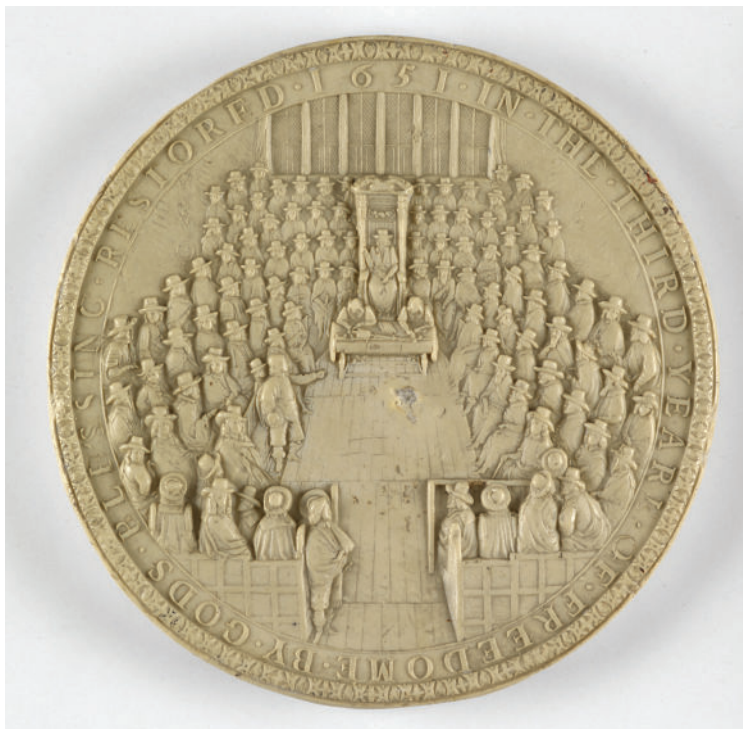
Above and front cover: The House of Commons in 1651, a cast of the obverse of the Second Great Seal of the Commonwealth, 1651. (Detached Seal XXXIX.17)