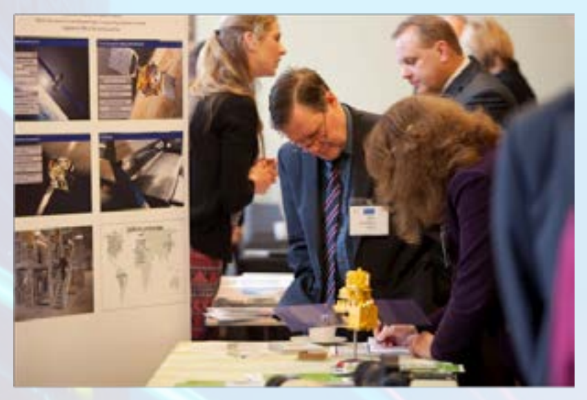
Attendees at a company display: Learned Society of Wales / Simon Gough Photography